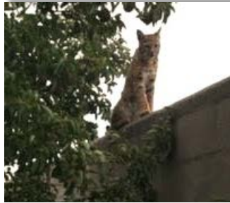
Bobcat sitting on a wall in Pueblos neighborhood.