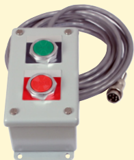
Remote Start/Stop Part #A3258

Vacuum base Uses shop air pressure to anchor to non-ferrous surfaces such as stainless steel, aircraft aluminum or even plexiglass.