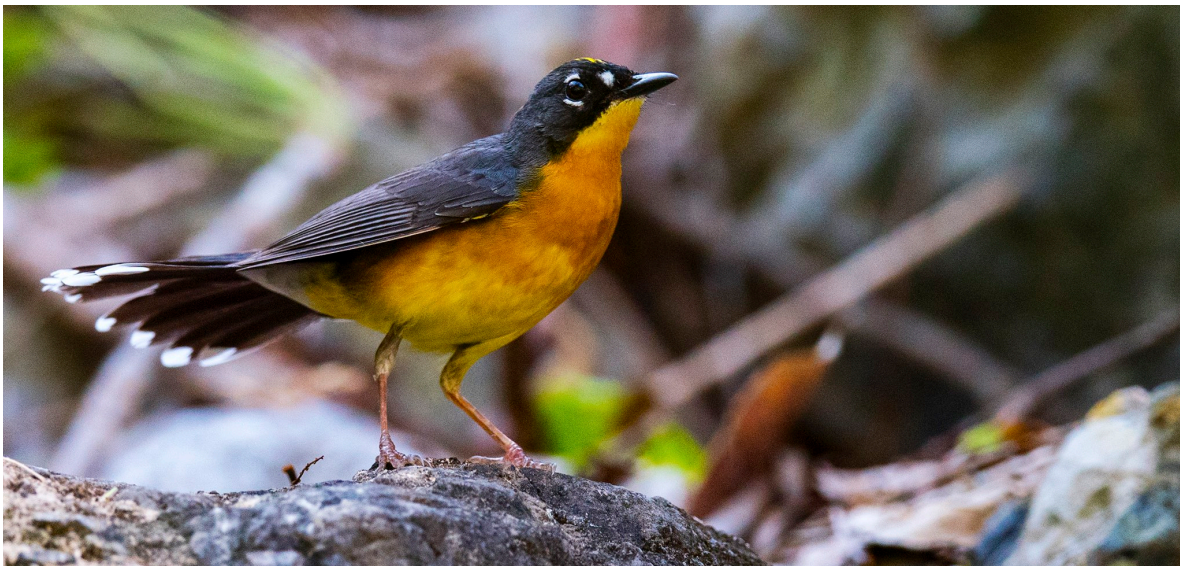
Fan-tailed Warbler

Overnight and dinner at Los Tarrales Lodge.