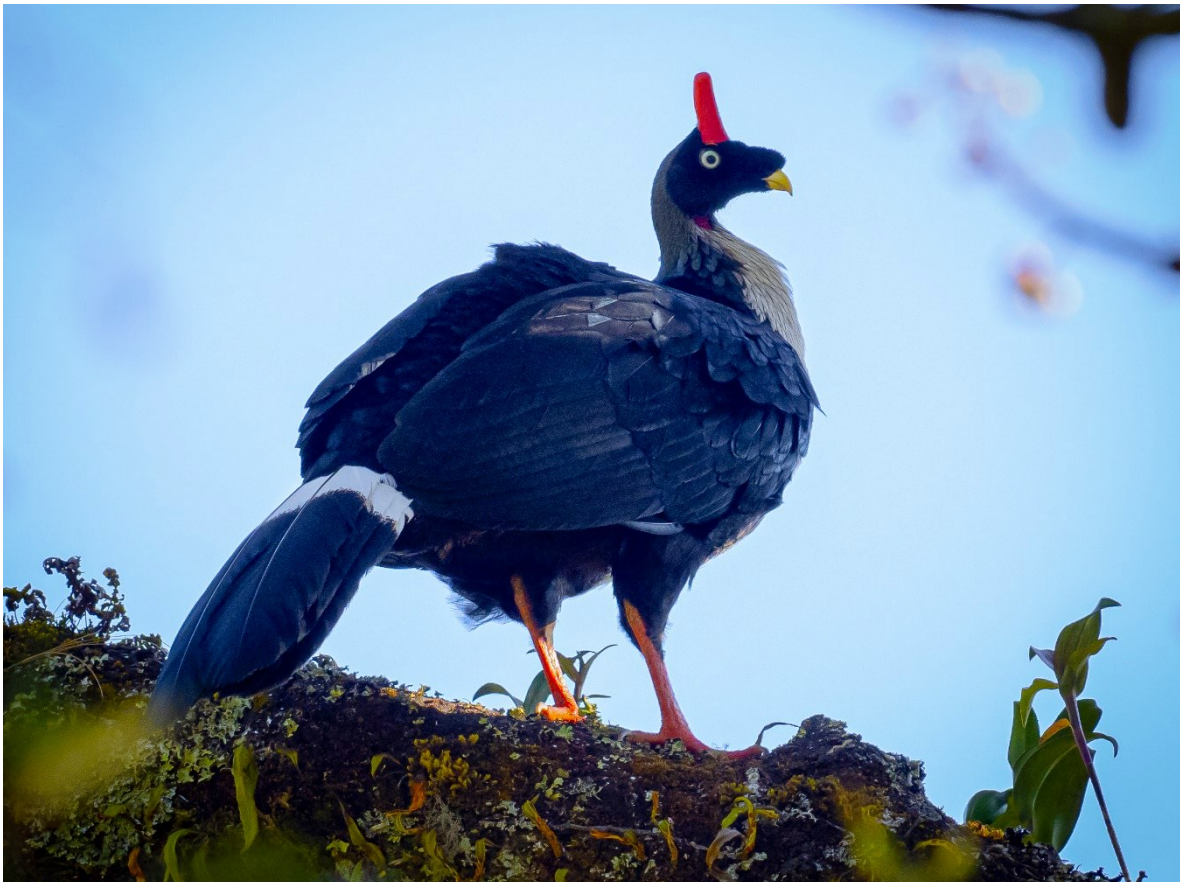
Horned Guan