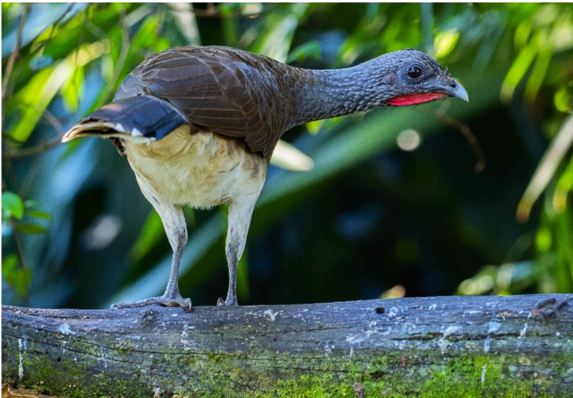
White-bellied Chachalaca

Overnight and dinner at Los Tarrales Lodge.