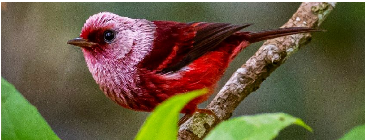
Pink-headed Warbler - Photo credit: Daniel Aldana

After an early cup of coffee at the hotel's front desk we will take a packed breakfast and drive west, getting into the higher pine oak forest at 2500 meters elevation. We will visit Finca Caleras Chichavac Private Reserve in search of the first gem of the trip... The Pink-headed Warbler. Along with this beautiful wood-warbler we can also expect to find such specialties as Guatemalan Pygmy-Owl, Amethyst-throated Mountain-Gem, Chestnut-sided Shrike-Vireo, Hutton's Vireo, Olive and Crescent-chested Warblers, Blue-and-White Mockingbird, Spotted Towhee and Mountain Trogon.