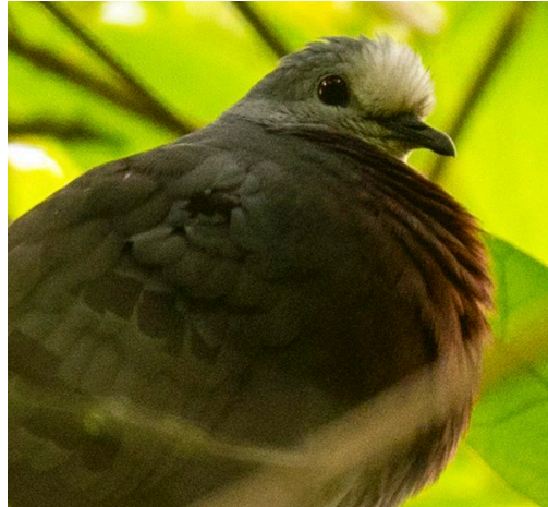
Maroon-chested Ground Dove

After lunch we will drive to the city of Huehuetenango. This drive will take us around 5 hours. Our destination will be the Sierra de los Cuchumatanes. Usually we make it to Chiabal (the town where our local guide Esteban lives). We will bird Chiabal in the late afternoon and later will head to our hotel in Todos Santos. At night we will be searching for one of the rarest owls in Central America, the Unspotted Saw-Whet Owl.