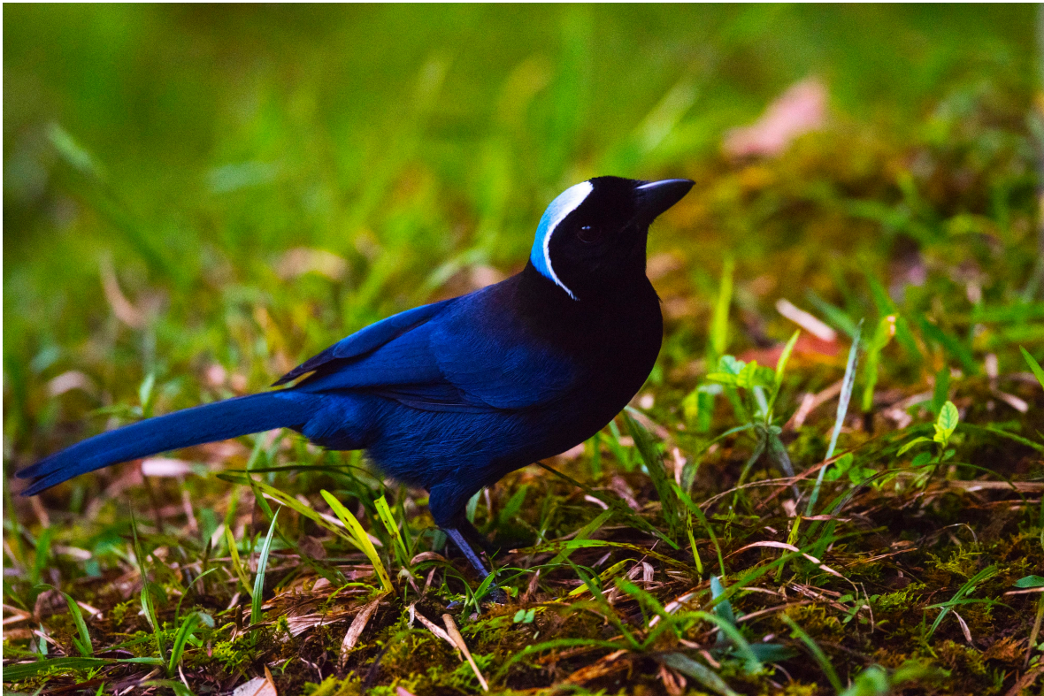
Azure-hooded Jay

End of the tour departure from Flores International Airport. Morning birding around El Remate/Santa Ana will be optional and will depend on departure flight times.