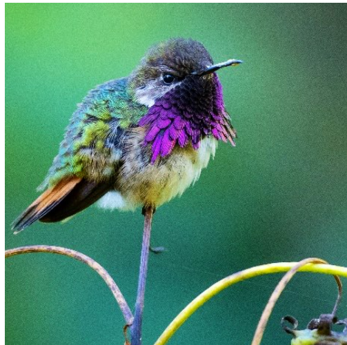
Wine-throated Hummingbird - Photo credit: Daniel Aldana