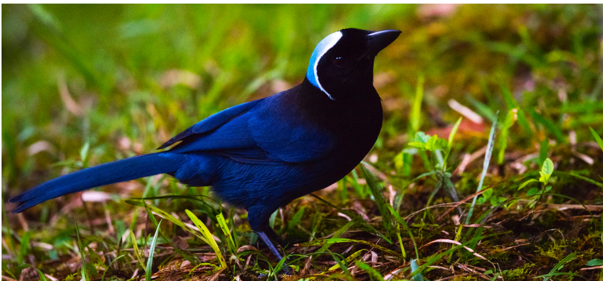
Azure-hooded Jay - Photo credit: John Cahill