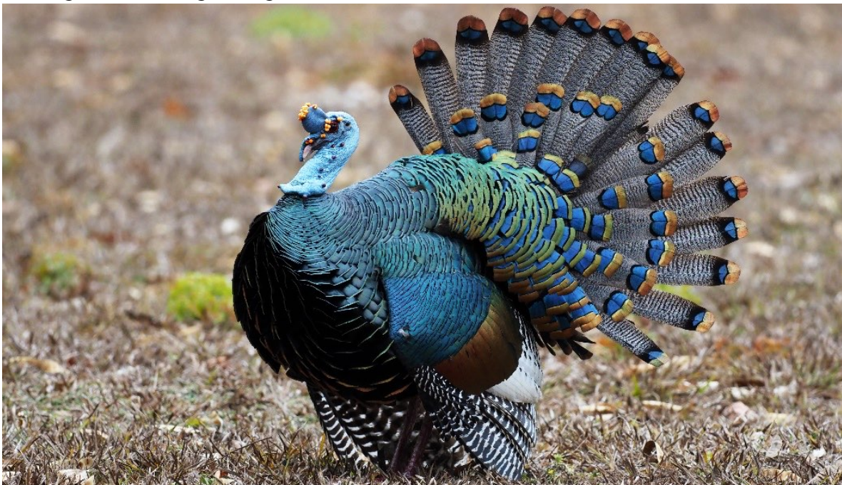
Ocellated Turkey - Photo credit: Daniel Aldana