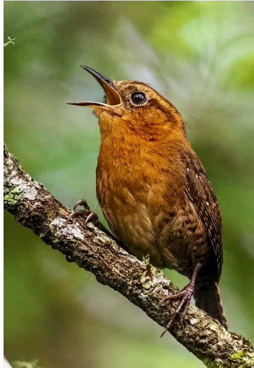
Rufous-browed Wren - Photo credit: Daniel Aldana

Participants attending the Tikal extension will depart from the Flores International Airport (December 13).