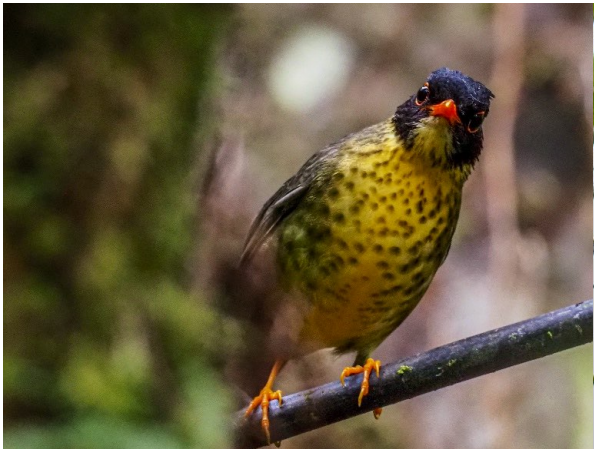
Spotted Nightingale-Thrush and Resplendent Quetzal