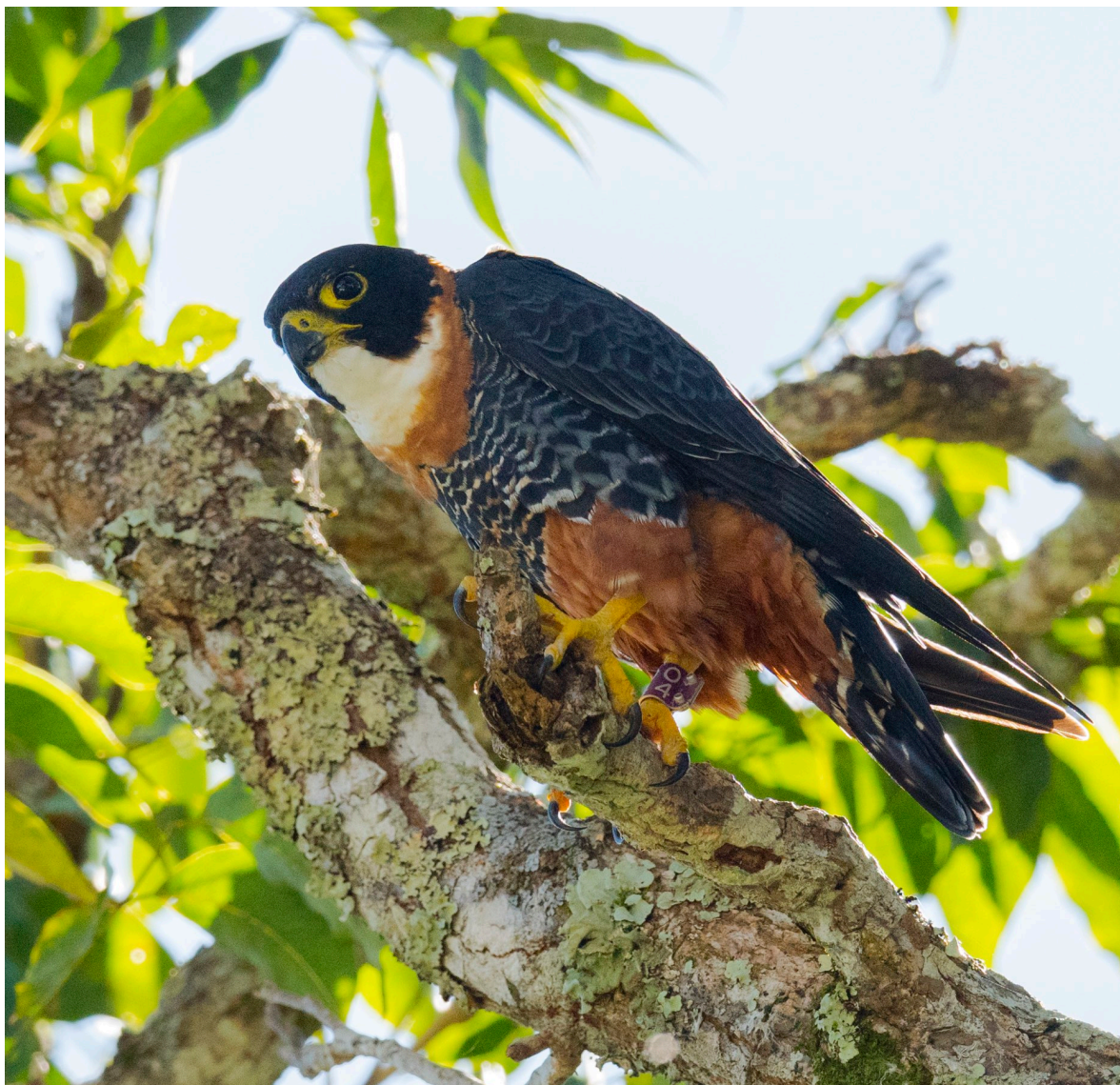
Orange-breasted Falcon

The birding tour officially ends at breakfast this day. Tikal extension participants will fly out from the Flores International Airport. Birding is optional during this day and will depend on participants departure times.