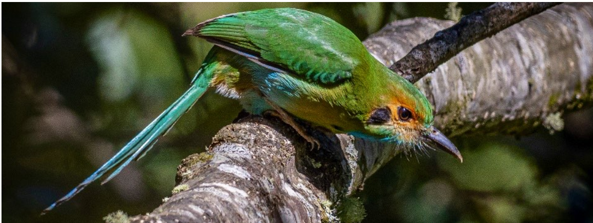
Blue-throated Motmot