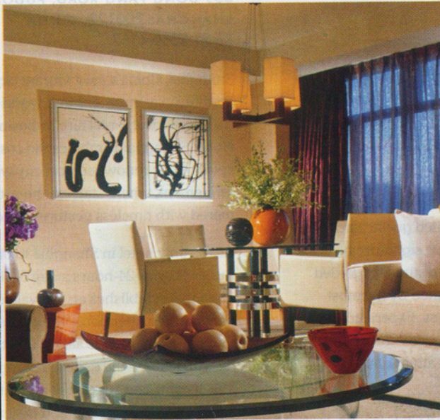
The Bund Suite, Shanghai