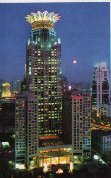
The Westin Bund Center Shanghai

An array of truly unique experiences elevate a stay at The Westin Bund Center Shanghai to the transcendent. At the world-renowned Banyan Tree Spa onsite, restore and revive yourself as massage therapists work their magic. Or indulge in a truly memorable Sunday brunch at The Stage and Prego, where world-class international cuisines are served together with awe-inspiring entertainment.