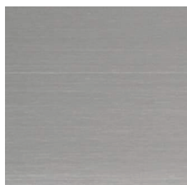
Clear Anodized Aluminum Finish

*Image may not accurately reflect actual finish