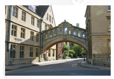
*refreshments at your own expense

Oxford Tourist Information www.oxfordcity.co.uk