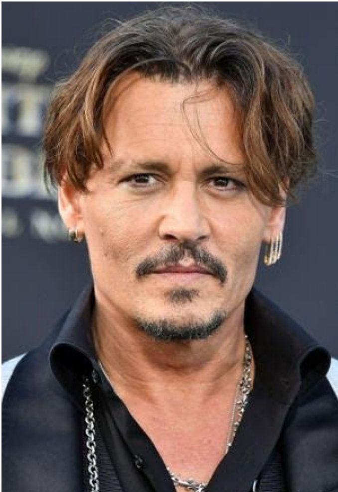
Johnny Depp as DYLAN