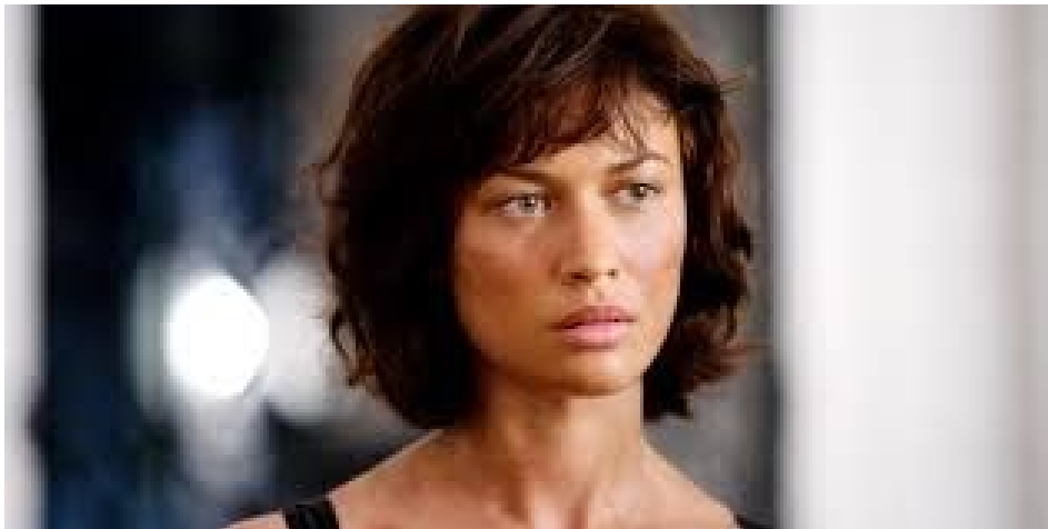
Olga Kurylenko as Zari/Svetlana/Spy Girl