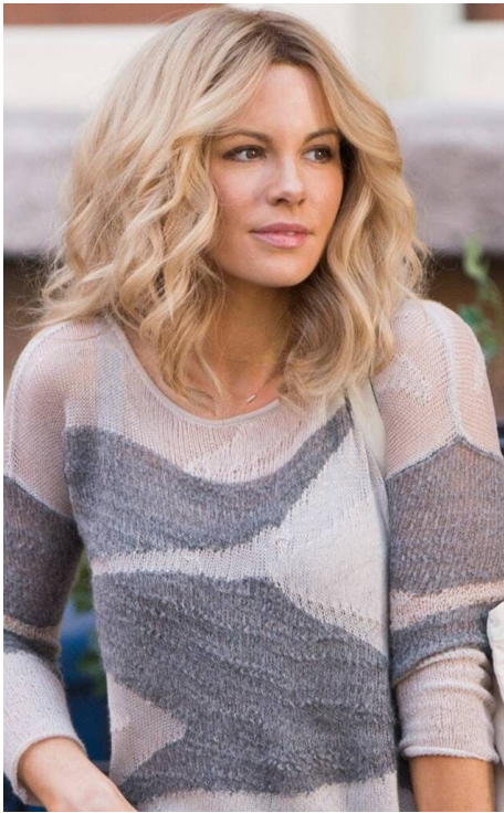
Kate Beckinsale as WHISKEY