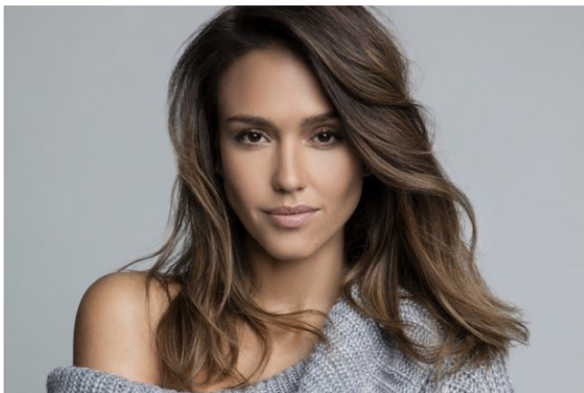
Jessica Alba as WHISKEY