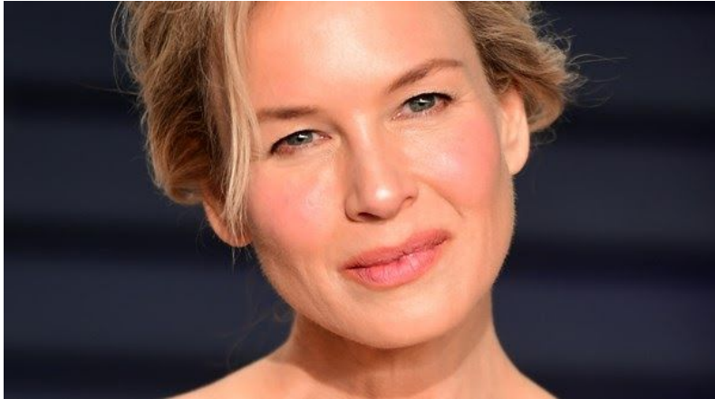
Renee Zellweger as WHISKEY

Present Day Mighty, 40's female, gorgeous, any ethnicity