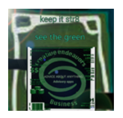
Positioning Members Analysis • Advisory Legal Forms

Trademark · Servicemark · Patent Technology · Licensing · Market Product Development