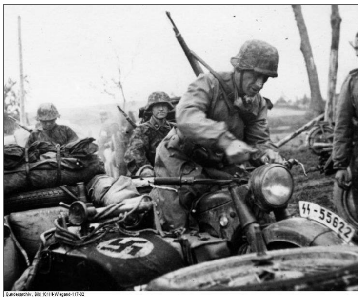
Bundesarchiv, Bild 101111-Wiegand-117-02 Foto: Wiegand | 1941

The motivations of these men were complex: the Flemings have their own culture and identity and some longed for a state independent of French-speaking Belgium. Some volunteered through a deep hatred of communism, often fuelled by their Catholic faith. Some, of course, were simply persuaded by Hitler's vision of a new world order.