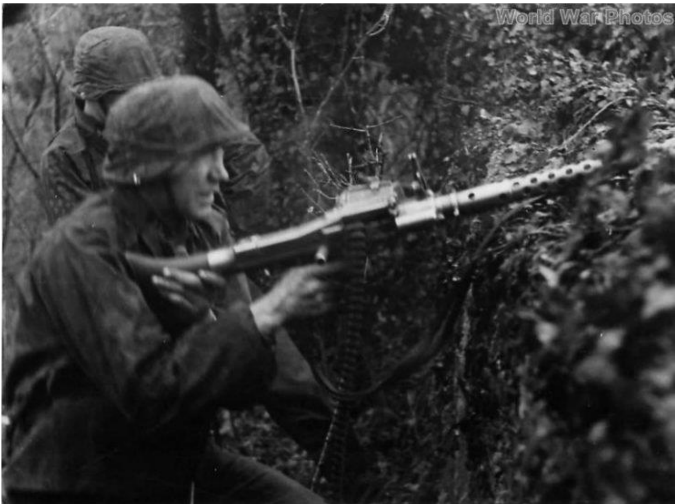
German Troops with MG 34 – Eastern Front 1944

Some stayed in Germany, some returned home, perhaps to trial as war criminals. The interviews and images gathered by Jonathan Trigg are vital historical documents.