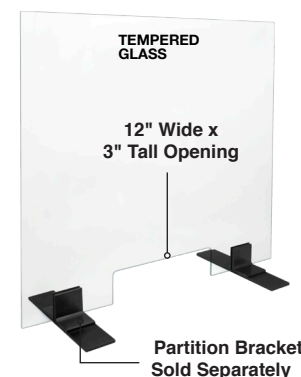
1/4" Clear Tempered Glass (With Pass-Thru)