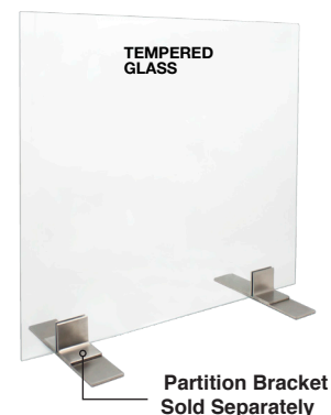
1/4" Clear Tempered Glass (No Pass-Thru)