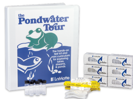
Home School Kits