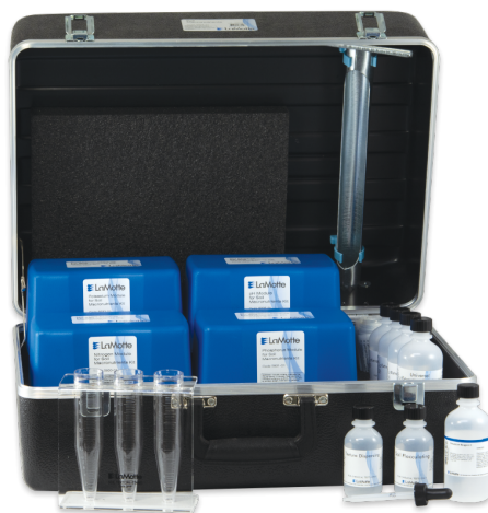
Soil Test Kits