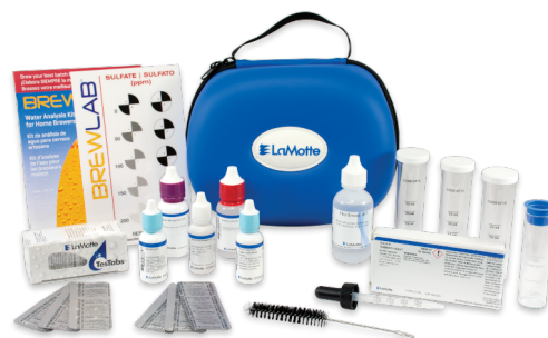
Home Brewers Testing Needs