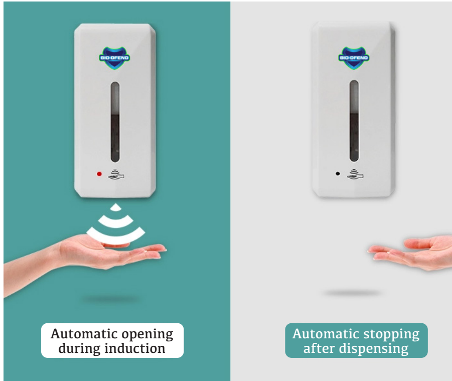
Automatic opening during induction

Quick response with automatic opening and stopping.