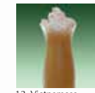
12. Vietnamese ice coffee