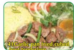
41 Garlic pan fried cubed beef tenderloin