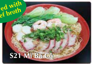
S21 Mì Ba Cô