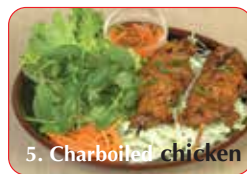
5. Charboiled chicken