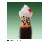
7 Thai ice tea