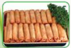
Crispy eggrolls $25 (25)***

Catering menu available, please ask your server.