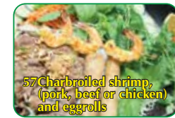
57 Charbroiled shrimp, (pork, beef or chicken) and eggrolls