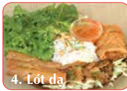
4. Lót dạ