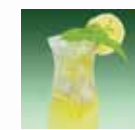
3. Fresh Lemonade