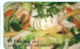
x1 Chicken and seafood with steamed rice