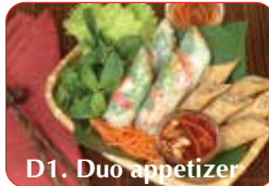
D1. Duo appetizer