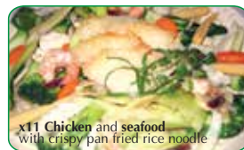
x11 Chicken and seafood with crispy pan fried rice noodle