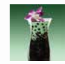
13. The Black Sea