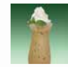
6. Milk Tea