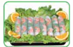
Spring rolls $27 (10)***