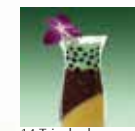
14. Tricolor bean

Add Ons 65¢ each Boba | Basil Seeds Red Bean | Grass Jelly