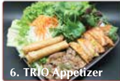
6. TRIO Appetizer