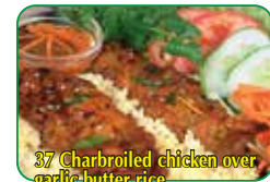
37 Charbroiled chicken over garlic butter rice