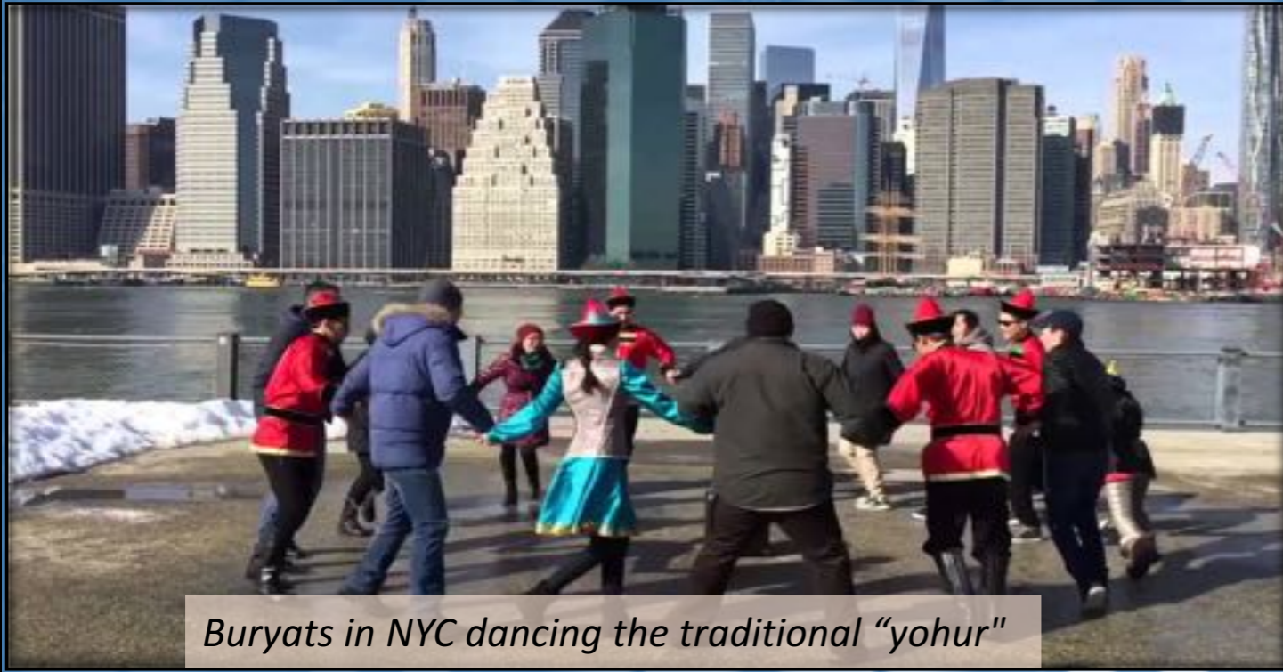
Buryats in NYC dancing the traditional "yohur"

Especially over the past several years, more and more Buryats are moving out of Buryatia in search of better jobs, more opportunities for travel, and a better life for themselves and their children. Many of them have moved out of Russia to places all over the world. Our desire is that God would use this Buryat "diaspora" to further His kingdom by giving them opportunities to hear and receive the Gospel of Jesus where they are living, and to also to be an instrument of bringing God's peace to other places in the world. And may God use the Buryat people to carry the Good News to other unreached Buddhist people groups!